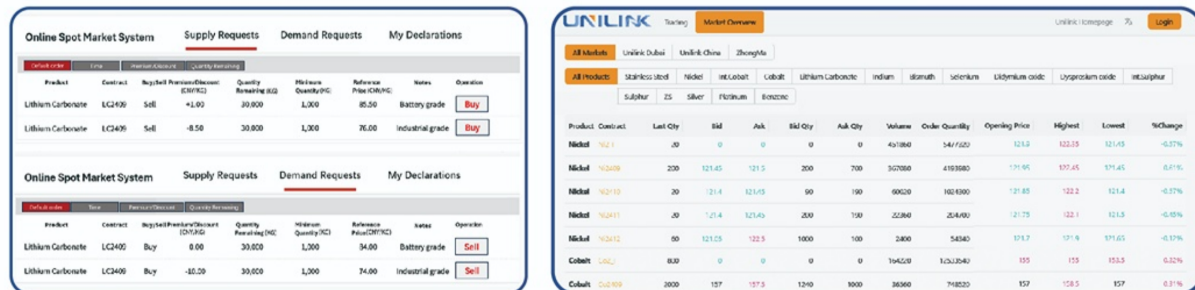
Spot Market System